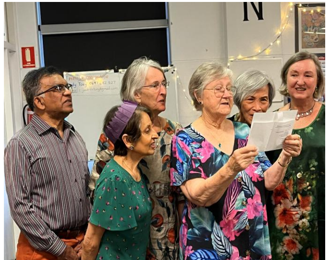
Santa Claus is coming to Town