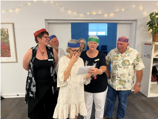
Rudolph the Red Nose Reindeer

View About Us at: http://www.fremantle.bridgeaustralia.org/