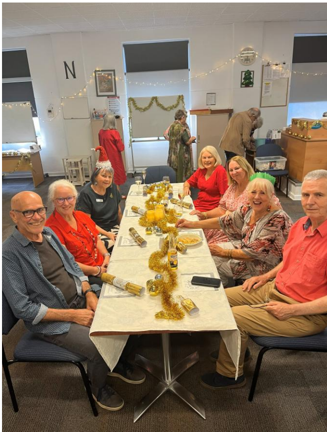
Tuesday Morning Supervised Group