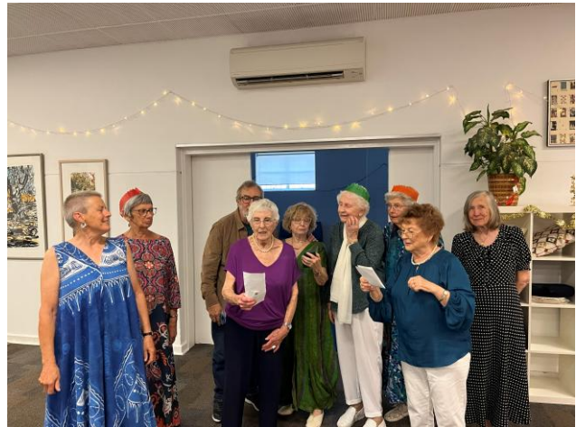
Deck The Halls with Boughs of Holly